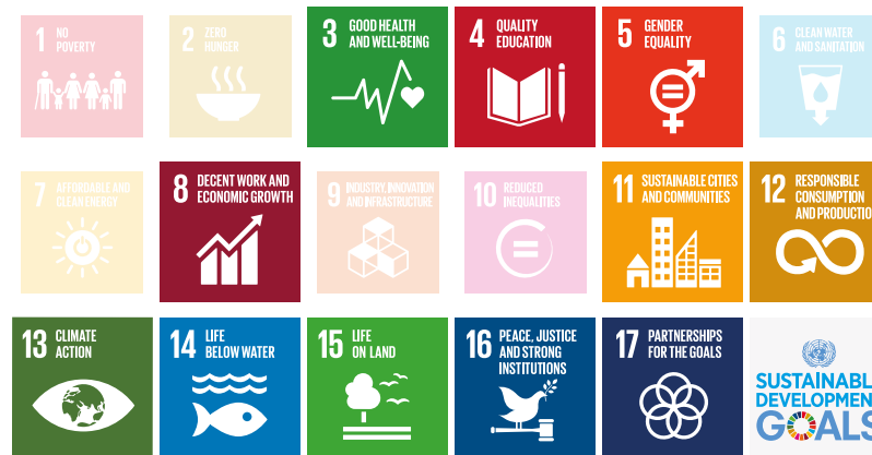
Key SDGs to which the IOC aims to contribute.

The core missions of the Olympic Movement, including social development through sport, are already closely aligned with a number of SDGs, notably in the fields of health and well-being (SDG #3), quality education (SDG #4), gender equality (SDG #5), peace, justice and strong institutions (SDG #16) and partnerships for sustainability (SDG #17). By further embedding sustainability in our activities, we believe we could reinforce the IOC’s contribution to these SDGs while contributing to several other SDGs, as illustrated below.